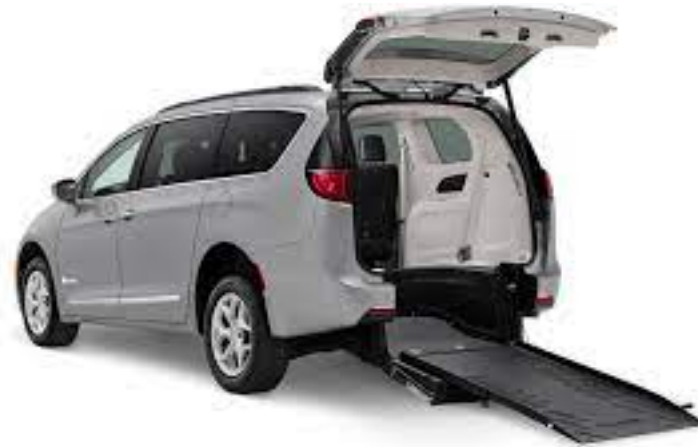
Rear Entry Ramp