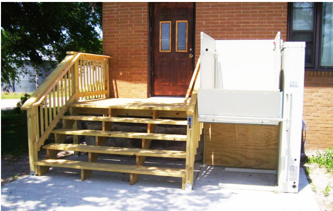
Vertical Platform Lift